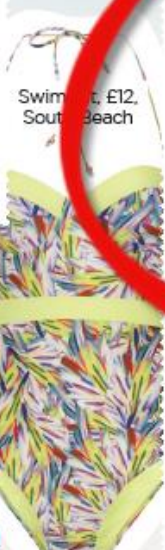
Swimsuit, £12, South Beach

Set amid the palm trees of Harbor Island, are seaside-luxe cottages with tranquil terraces. Go snorkelling and kayaking, or just lie on a lounger and let your cares melt away. From £3125pp† for eight nights, including a stopover at The Setai in Miami, incl. breakfast, return flights from Heathrow and private transfers, carrier.co.uk