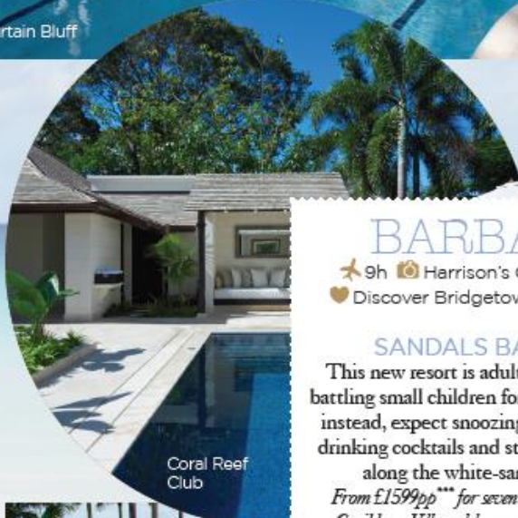
Coral Reef Club

From £1875pp**** for seven nights, incl. breakfast, return flights, private car transfers and UK airport lounge passes, elegantresorts.co.uk